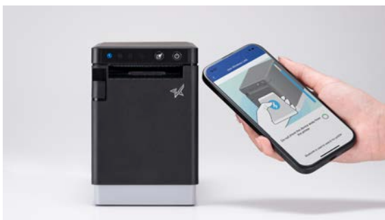
Simple Bluetooth and WLAN set-up via QR code or Star Quick Set-Up Utility